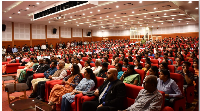
INAUGURATION CEREMONY FOR PGDM BATCH 31 & BA 05