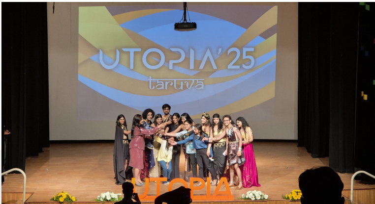
CULTURAL EVENT WINNERS IN INTER-COLLEGE COMPETITION