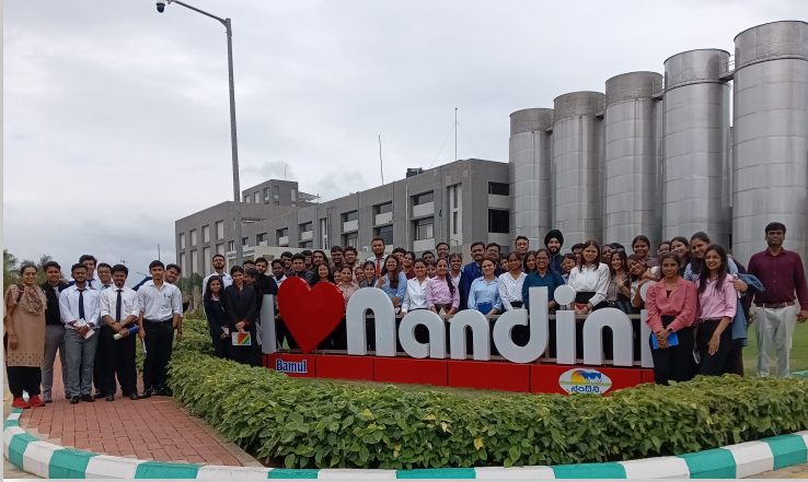
INDUSTRIAL VISIT TO BANGALORE MILK UNION LTD.(BAMUL)